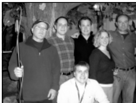
Jeff Corwin and students from CDIA.