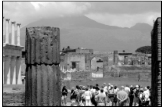
Pompeii, Italy