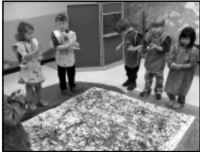
Preschoolers create masterpieces in the style of Jackson Pollack.

Nature Center Preschool Arts Show • May 20 - June 2 • This show features the art work made by the children from the Nature Center Preschool classes. They have studied artists Paul Cezanne, Jackson Pollack and author Peter H. Reynolds as well as others. Easel painting without any teacher direction is also featured. All art emphasizes the process of making art and their works convey their individual artistic expressions. Join us at an opening reception on Wednesday, May 21, 6:00-7:30 PM.